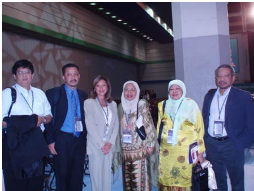
At the opening ceremony of WLIC at COEX

We arrived at Seoul's Incheon Airport in good time and soon found ourselves at the immigration counters. Here was our first encounter with Korean officialdom and we were unimpressed. There were long and very slow queues for non-Korean passports as there was only one counter open but there were several for Korean passports. Perhaps it was too early in the morning and they were not expecting visitors. Another counter opened and those in the back of the queue rushed to the new counter only to find out that the computer was not working. So back they came to join the original queue. We could not believe that this was Seoul and started making comparisons with KLIA's immigration and technology wise, we are definitely better off. Before long, a very busy looking official started directing people to other queues and we noticed that new counters had opened. This started a rush for the other 2 or 3 counters and things started moving. The same official busied himself ushering people to different queues as it got shorter. But we decided to stay put as our queue was also moving rather quickly and we did not take kindly to being directed here and there.