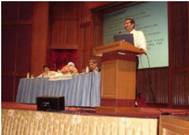
Ahli panel membentangkan kertas kerja

Jawatankuasa Tetap Perpustakaan Khusus, PPM dengan kerjasama Perpustakaan Negara Malaysia, buat julung kalinya, telah menganjurkan seminar ini pada 5 Julai 2006 di Auditorium Perpustakaan Negara Malaysia, Kuala Lumpur. Antara objektifnya ialah untuk meningkatkan pengetahuan dan kemahiran dalam menjalankan kerja pendigitan, berkongsi pengalaman menjalankan kerja pendigitan koleksi perpustakaan, dan merancang ke arah pemuliharaan bahan melalui pendigitan.