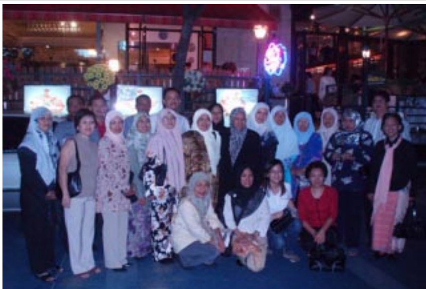
Dinner at PASHA, a Turkish Restaurant