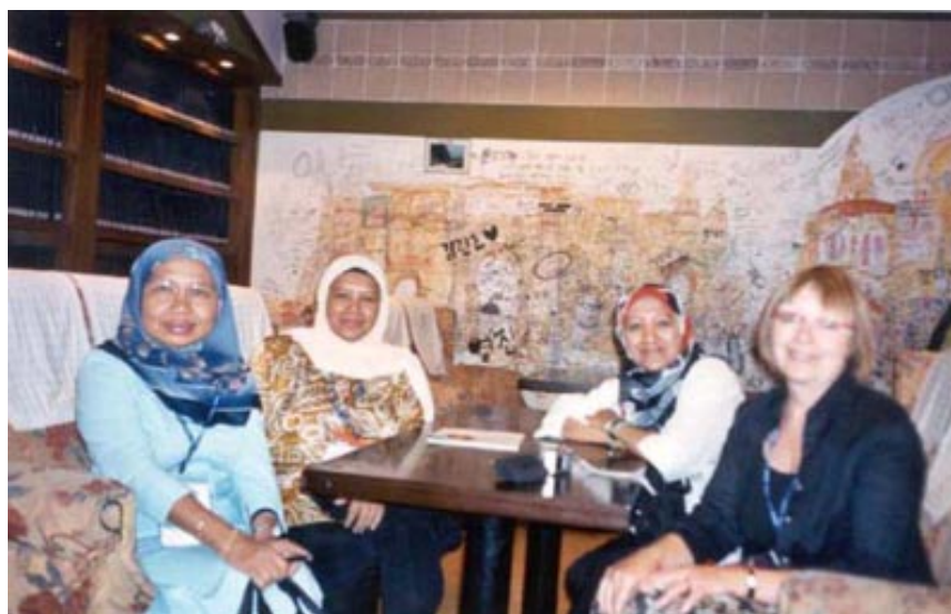
Library visit - Book Cafe, Saengbok Digital Public Library - cosy sofas where people can enjoy books & tea

I took the opportunity to visit the Korea Literature and Translation Institute (KLTI) which was near the Coex to find out how the Koreans manage to bring translation of current works so quickly. Two young ladies attended to me. One of them was the one I communicated with via email. Her colleague, who was in international relations, had lived in Canada but attended University in Korea and spoke very good English.