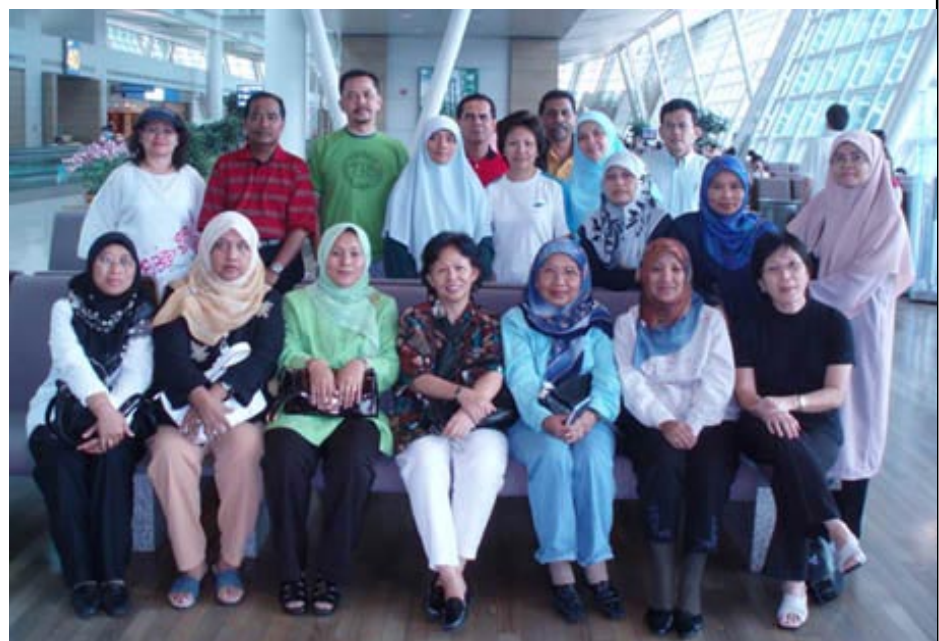
At Incheon Airport - looking forward to flying home

* The rest of the group left Seoul on Saturday 26 th August. They were fortunate to be able to visit the DMZ (Demilitarized Zone) as well as an amethyst factory and a silk market on the day I left Seoul !