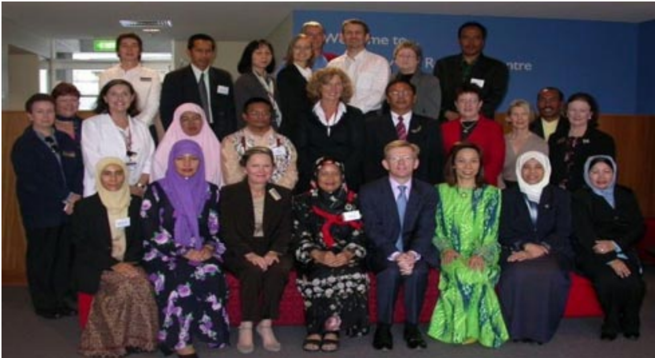
Peserta kursus bergambar bersama fasilitator-fasilitator UQ