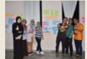
Celebration of Thinkers