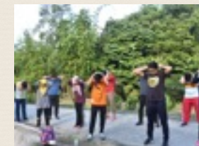
Healthy Body Healthy Mind