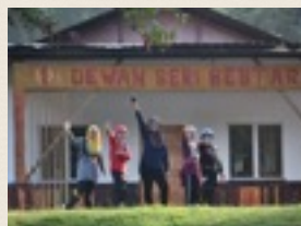
We are built for the nature