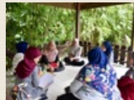
Exploration with World Cafe