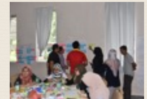
Future Backward & Gallery Walk