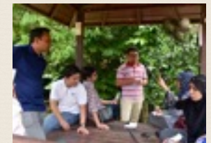
Flexible learning with World Cafe