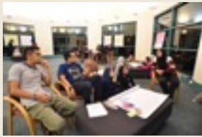
We Built the Future

1645 - Capturing key questions for Day 3