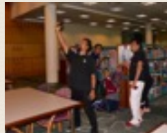
Lead & Play