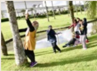
The Importance of Having Fun