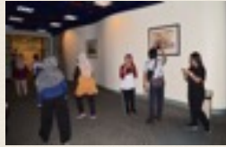
Discovery & Serendipity