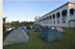
Flexible Learning & Environment