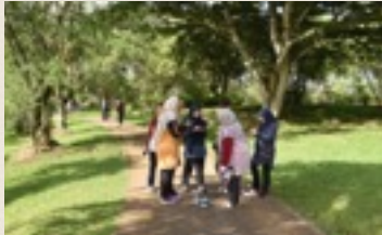
Leadership & Listening